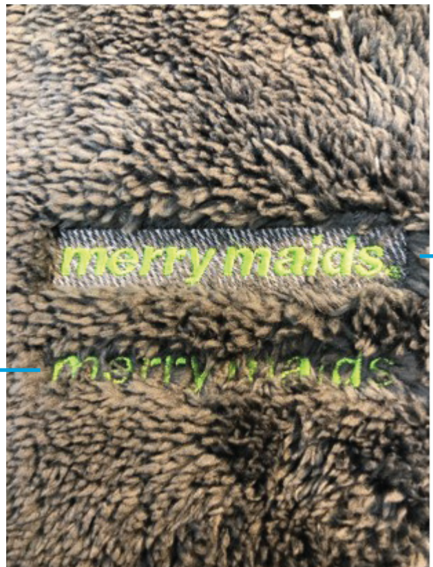
Logo with Laydown Stitch applied beneath