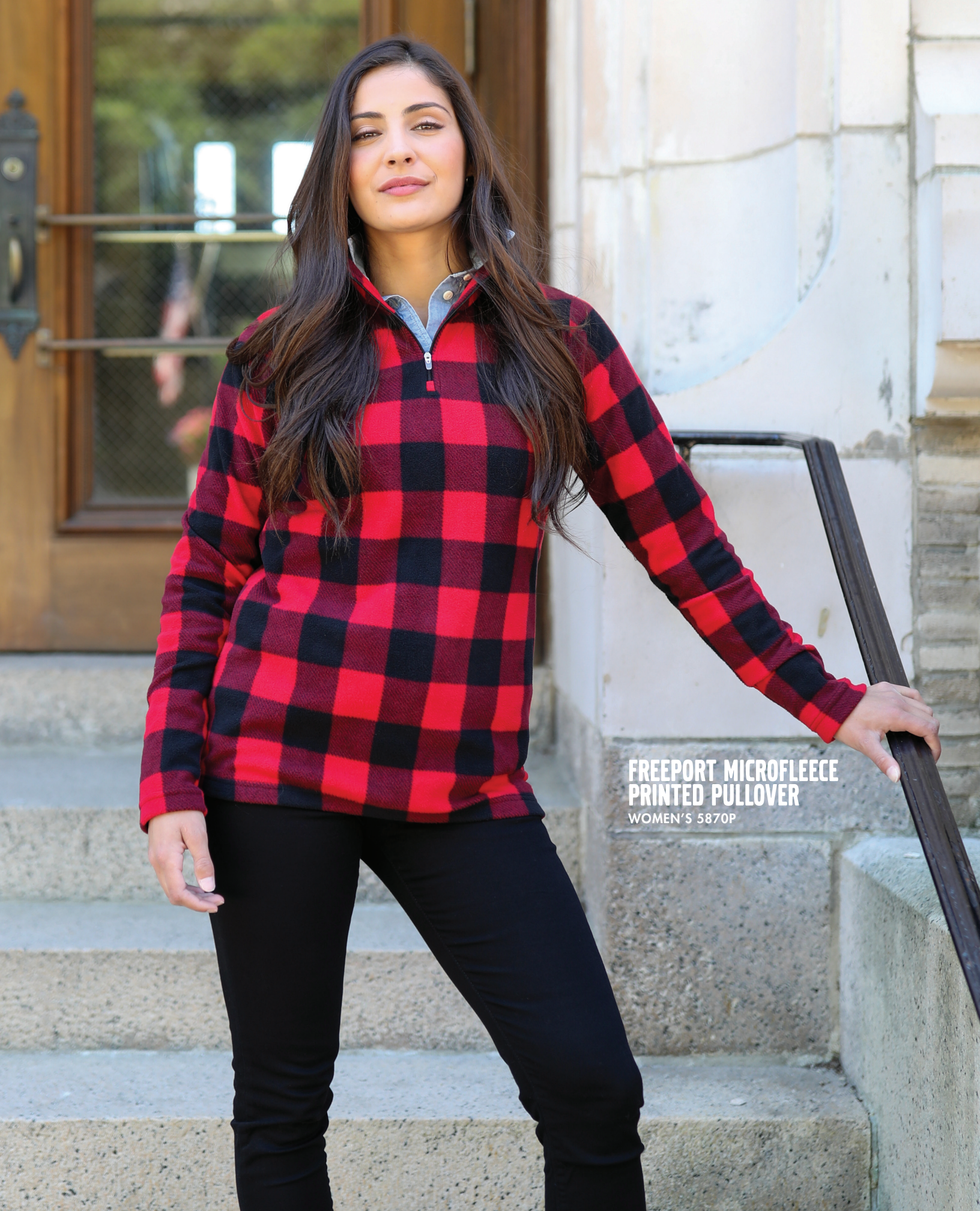
FREEPORT MICROFLEECE PRINTED PULLOVER WOMEN'S 5870P