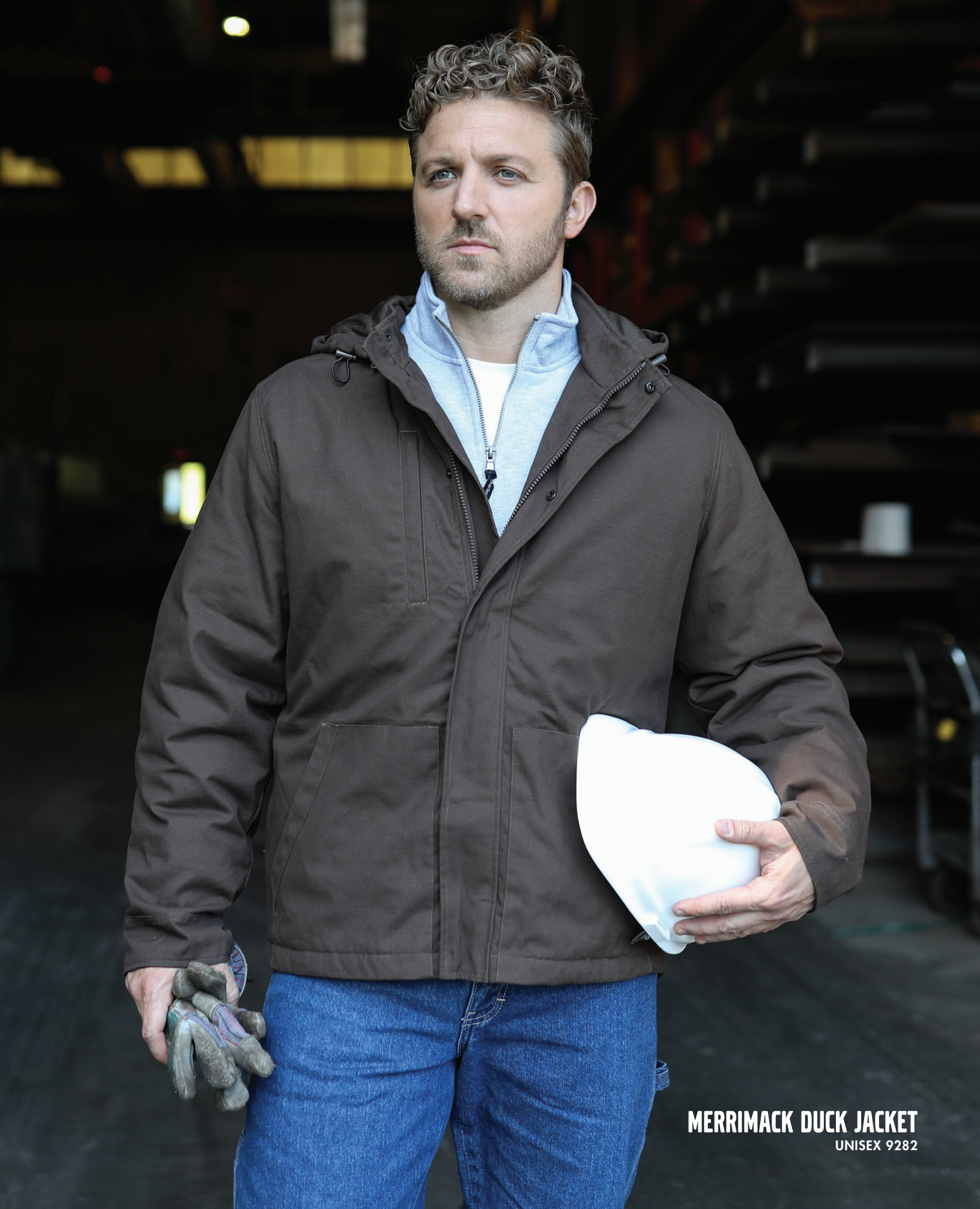
MERRIMACK DUCK JACKET UNISEX 9282